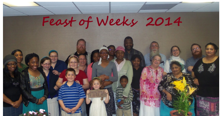
Yahweh's Assembly in Glouster, Ohio

As each week passed by in our count from the Wave Sheaf Observance, the anticipation built towards Yahweh's next Pilgrim Feast. As the seventh Sabbath began on the evening of May 9, 2014, Yahweh's Obedient Servants came together at the Burr Oak Conference Center in Glouster Ohio to begin the 48-hour double Sabbath together with a bible reading and prayer service. The pristine beauty of the Ohio hills and quiet environs were the perfect backdrop for the tremendously inspiring gathering. With worship services on Sabbath Morning and three times on the Shavuoth High Day, the time was spent in Bible Study, fellowship, prayer, and Praise of our Heavenly Father Yahweh.